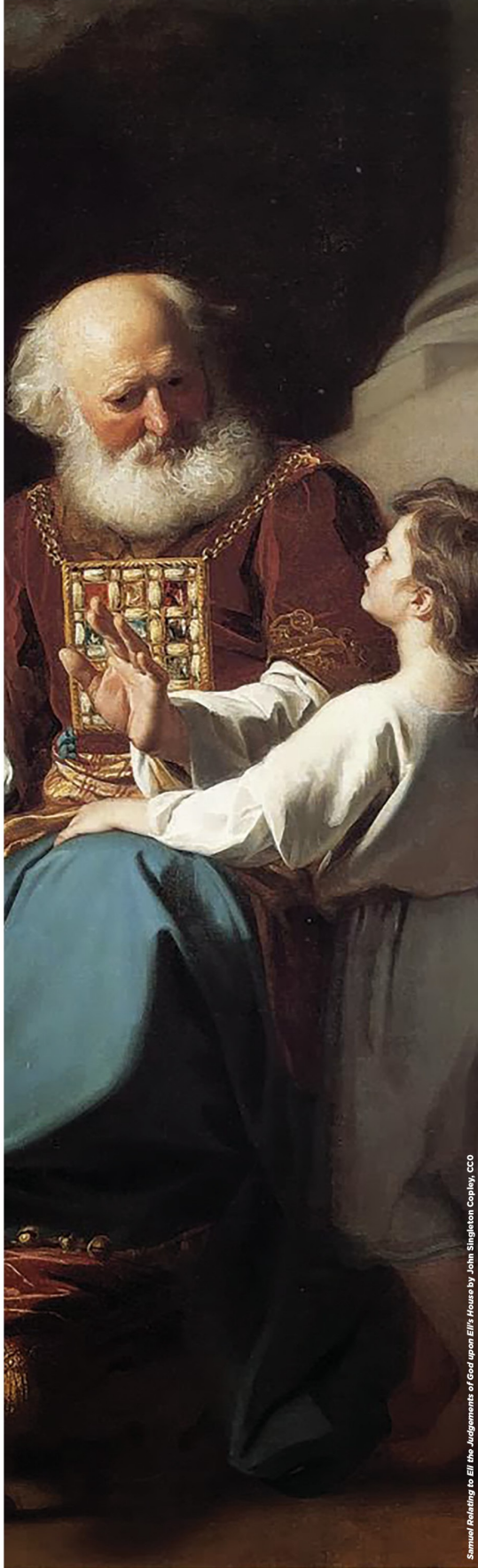
Samuel Relating to Eli the Judgments of God upon Eli's House by John Singleton Copley, CC0